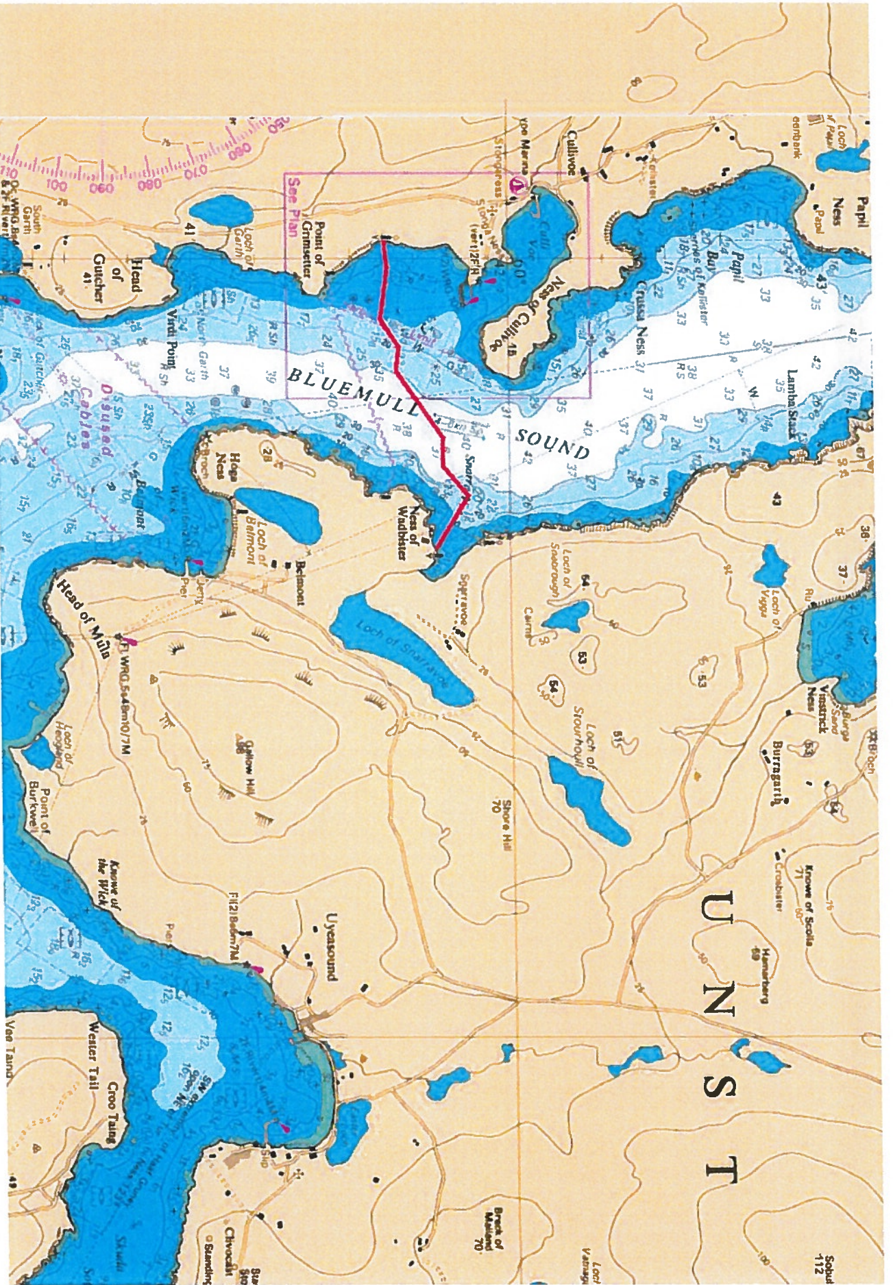
Figure 1 - Yell - Unst (North) Admiralty Chart