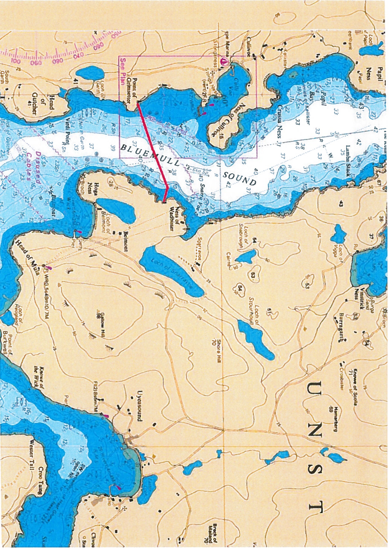
Figure 1 - Yell - Unst (South) Admiralty Chart